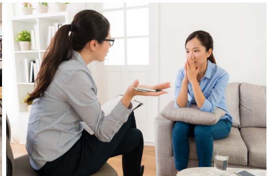
Private Counseling Suite