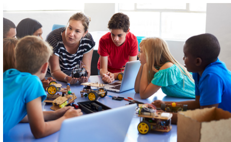
After School Programming

Expanding WCCares is a high priority for sure. The need is great. Additional space will deeply enhance our ability to meet needs and heal hurts, in the name of Jesus!