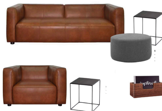
"Friendly Neighbor" Colors and Textures