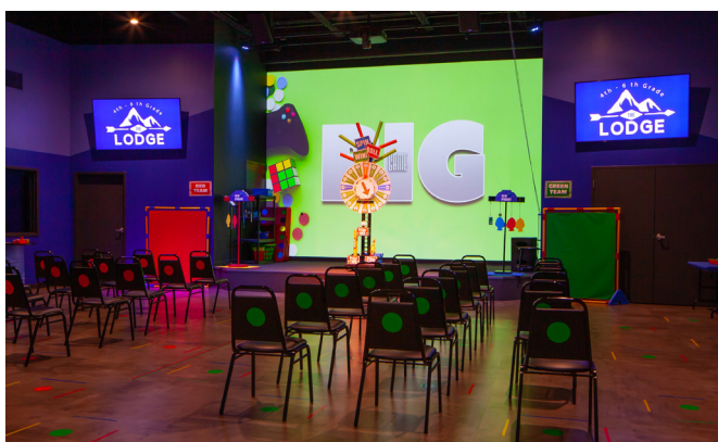
Age appropriate worship experience