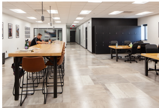
Open, Collaborative Space