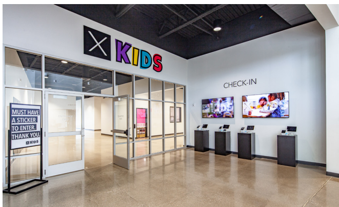
Secure Check In