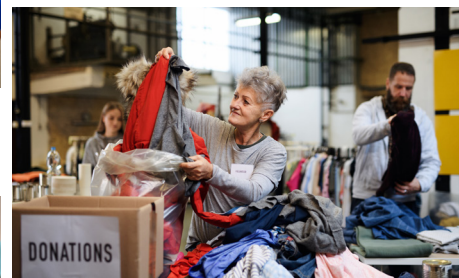
Expanded Wardrobe Warehouse