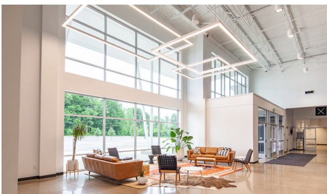
Plenty of Seating