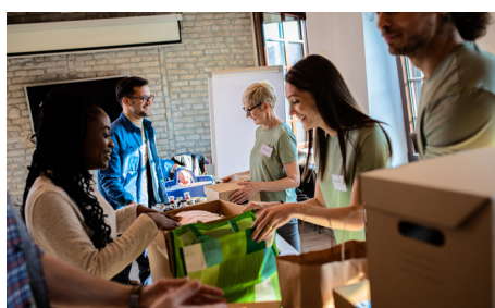
Food Packing Warehouse