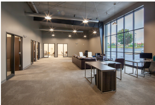
Lots of Glass Facing College Avenue