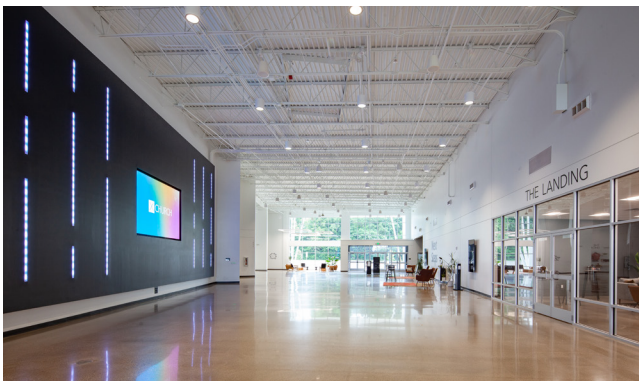
Bright and Open

Planned first impressions create good relationships. Creating dynamic lobby space with a look and feel that says "you are welcome here" is fundamental to deliberate hospitality.